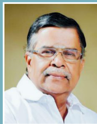
His Excellency Shri La Ganesan Hon'ble Governor of Nagaland (from 20 February 2023)