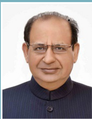
His Excellency Prof. Jagdish Mukhi Hon'ble Governor of Nagaland (up to 19 February 2023)